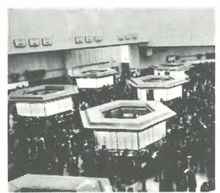
We can advise you on all areas of financial investment.

Although The Hongkong Bank Group originated in Asia, we have always had a very international outlook. Much of the financial support for overseas investment and trade by Asian companies doing business outside Asia has come from us. If your company is interested in establishing or building up its business anywhere throughout the world, you should consider using the accumulated knowledge, understanding and resources of The Hongkong Bank Groun.